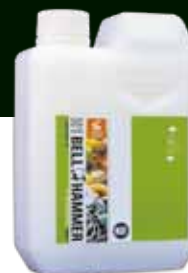
H1 BELL HAMMER Stock Liquid (1000mL) (undiluted liquid)