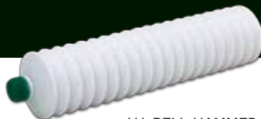
H1 BELL HAMMER CARTRIDGE GREASE No.2

Please use appropriate amount applied to a variety of food manufacturing machinery and production line.