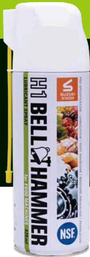
H1 BELL HAMMER SPLAY (420mL)